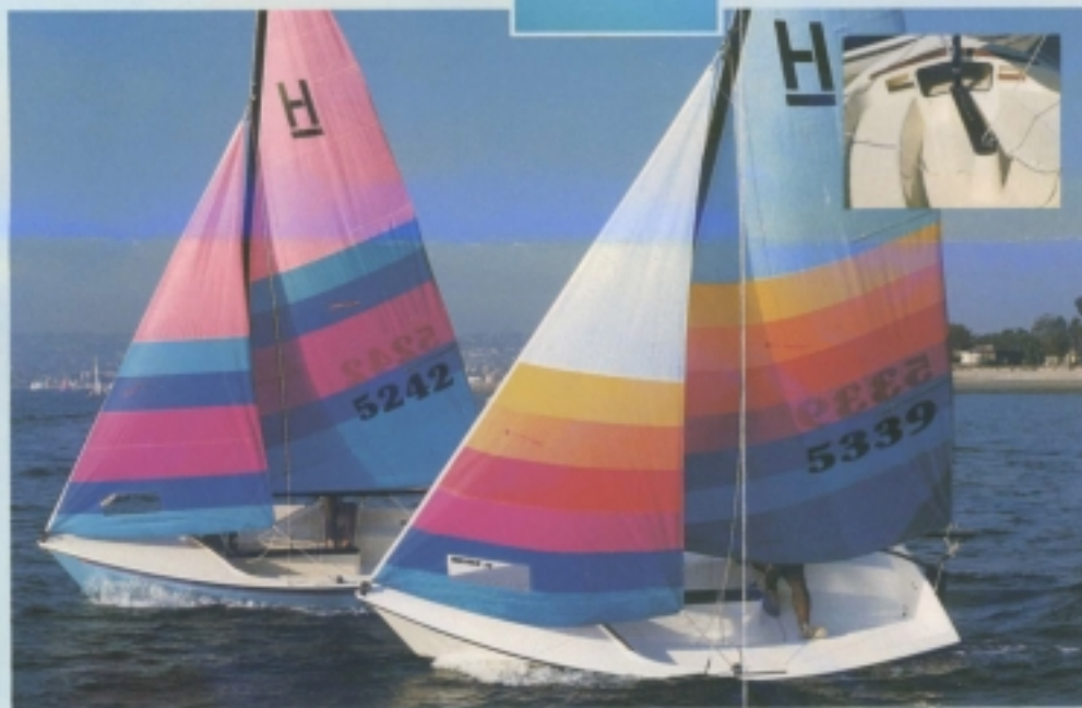
Fiberglass "Kick-up" Rudder