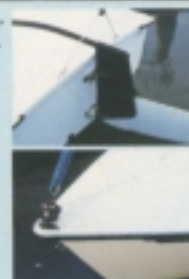
Optional roller furling system makes handling of jib sail even easier.

Hobie Cat offers one of the strongest limited warranties in the industry. During the first year of ownership Hobie Cat will replace or repair any defective part or parts free of charge. The boat, hull and deck have a full five-year prorated warranty that can even be transferred to subsequent owners, a big boost to the resale value of your boat. Be sure to see the warranty for complete terms.